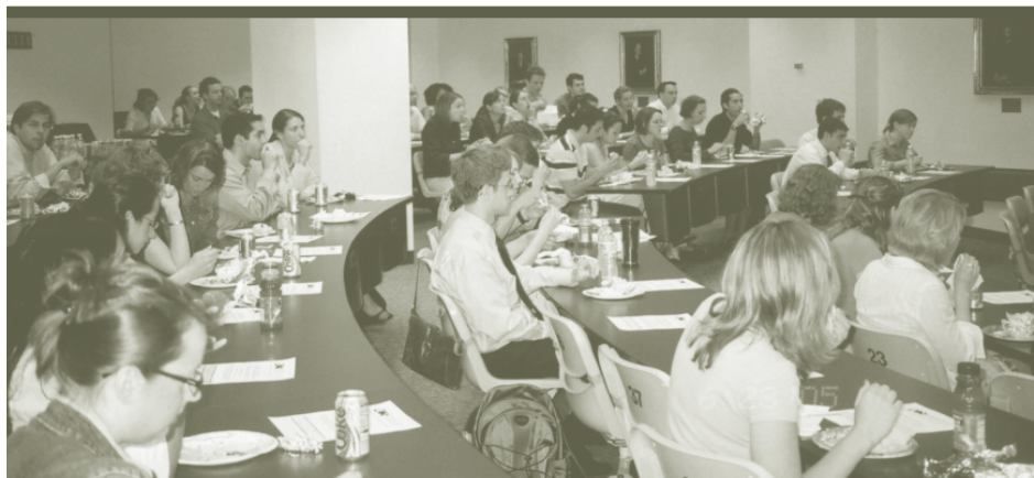
The 2005 class of interns and fellows gather for the Seminar Component.