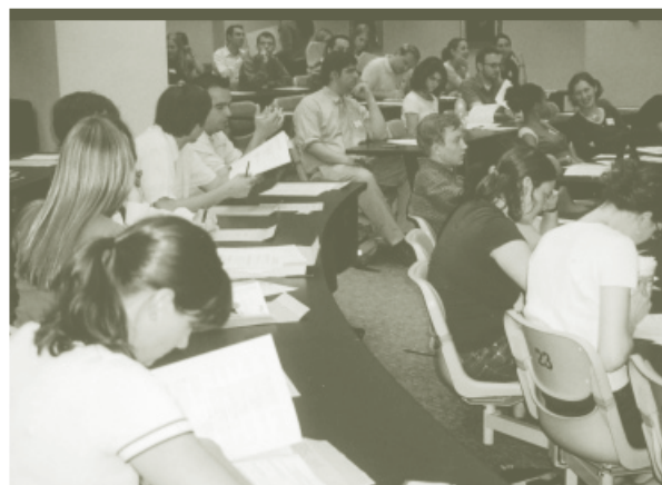
Interns and fellows credit their PILI experience for continuing pro bono work.