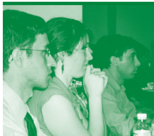
Seminars introduce interns and fellows to public interest law and career options.

The valuable practical experience interns and fellows gain in performing their first legal work often launches careers dedicated to serving the public interest, or becomes the cornerstone for a career-long commitment to pro bono work while in private practice. A 2003 external evaluation survey of program alumni found that 65% of interns and 80% of fellows cited their PILI experience as the impetus to engage in pro bono activities after law school graduation. In this way, our programs continue to generate legal services for the poor long after internships and fellowships are completed.