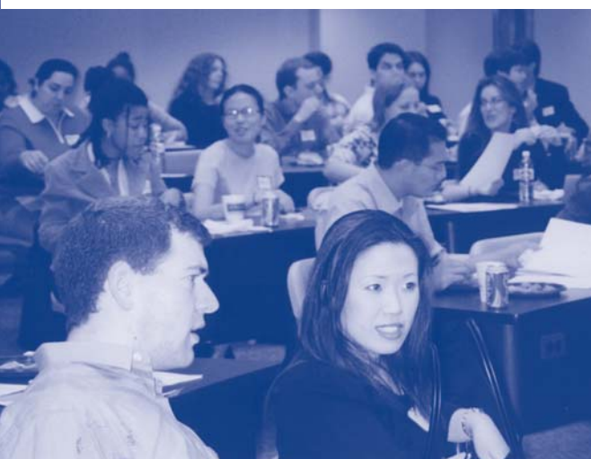
THE 2003 CLASS OF INTERNS AND FELLOWS GATHER FOR THE EDUCATION PROGRAM.

PILI's original concern about the unmet legal needs of disadvantaged people was the impetus for efforts in the early 1990's to facilitate more pro bono work from the legal community. New efforts in